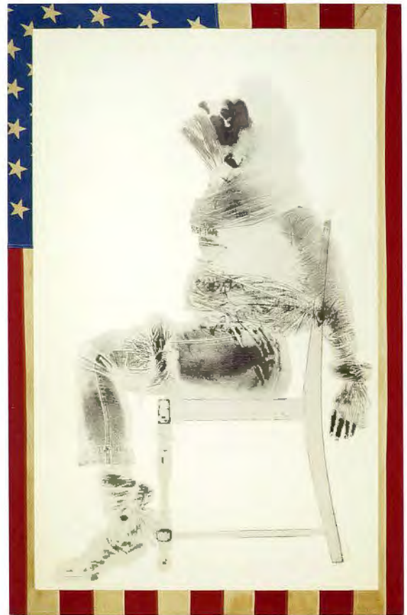
FIG. 9 DAVID HAMMONS (AMERICAN, BORN 1943)

Injustice Case , 1970. Body print (margarine and powdered pigments) and American flag; framed: 175.26 × 120.02 × 5.72 cm (69 × 47 ¼ × 2 ¼ in.). The Los Angeles County Museum of Art. Museum Acquisition Fund (M.71.7).