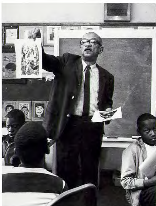
FIG. 10 Charles White visiting a Los Angeles school classroom, mid- to late 1960s.

Injustice Case , 1970. Body print (margarine and powdered pigments) and American flag; framed: 175.26 × 120.02 × 5.72 cm (69 × 47 ¼ × 2 ¼ in.). The Los Angeles County Museum of Art. Museum Acquisition Fund (M.71.7).