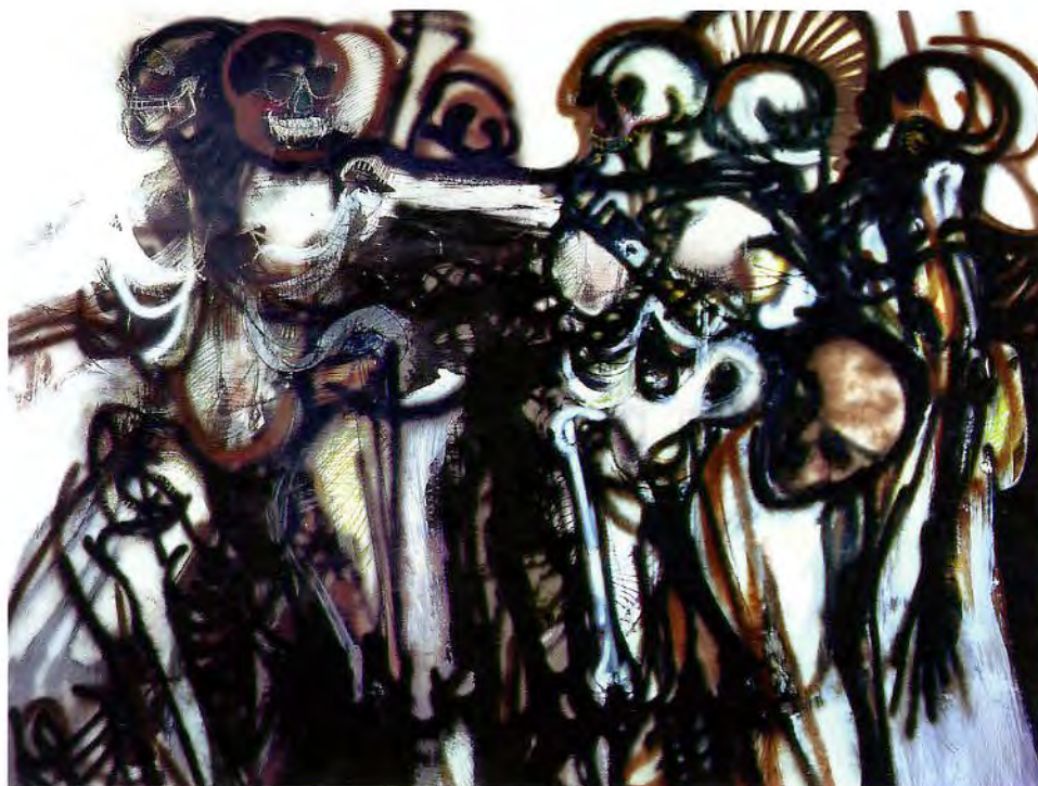
FIG. 7 JUDITHE HERNÁNDEZ (AMERICAN, BORN 1948)

Viva la Revolución! , 1974. Spray paint, gesso, and pastel on paper; 182.8 × 243.8 cm (72 × 96 in.). Courtesy of the artist.