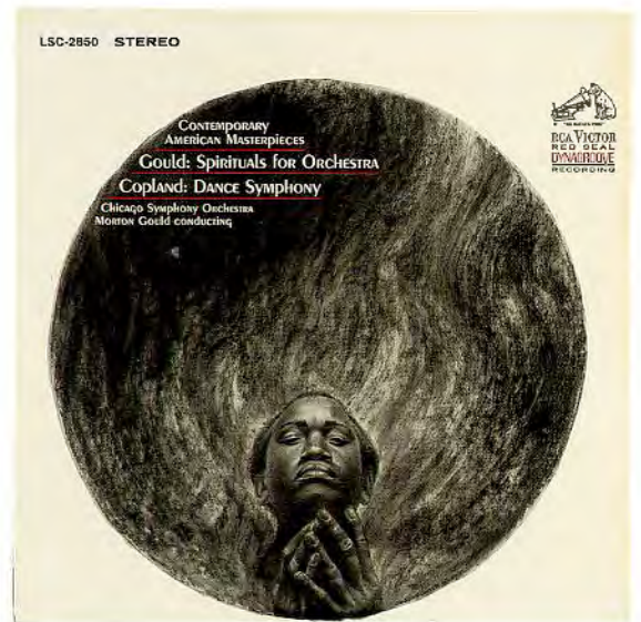
FIG. 5 Charles White drawing reproduced on the cover of Contemporary American Masterpieces: Gould: Spirituals for Orchestra; Copland: Dance Symphony (RCA Records, 1965).

In fact, the work White made leading up to and during his time at Otis is some of his most experimental. The crouching nude figure in Birmingham Totem (pl. 70), a drawing made in 1964 in response to the 1963 Alabama church bombing that killed four young girls, squats atop a pile of building rubble. That pile is a tour de force of abstract mark making, with grids and planes thrusting up and toward the viewer. Similar passages of graphic experimentation can be seen in the rocks and grass in General Moses (Harriet Tubman) (pl. 79) and in the area surrounding the head at the top of Nat Turner, Yesterday, Today, Tomorrow (pl. 85). In Dream Deferred II (pl. 86), the variously shaped detritus seemingly attached to the side of a dilapidated house are also layers of geometric abstraction weighing down on the figure who peers out from beneath them. White used unorthodox techniques to apply ink to illustration board, and he encouraged his students to experiment as well, specifying on his syllabus that “[a]side from the conventional drawing tools, students will search for and discover the unconventional such as: balsa wood, Kleenex, rags, branches, wax, cue sticks, leaves, etc., etc.” 52 He found his Otis students a receptive and inspiring audience: “Oh, it’s such a beautiful, reciprocal kind of relationship, one in which both teacher and student grow as a result of the mutual contact. I’m not too happy about my own peer group.